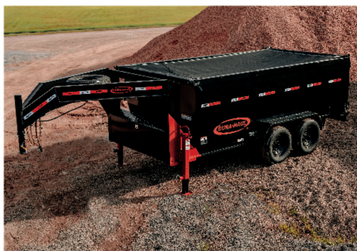
Extra long 20 ft tarp.