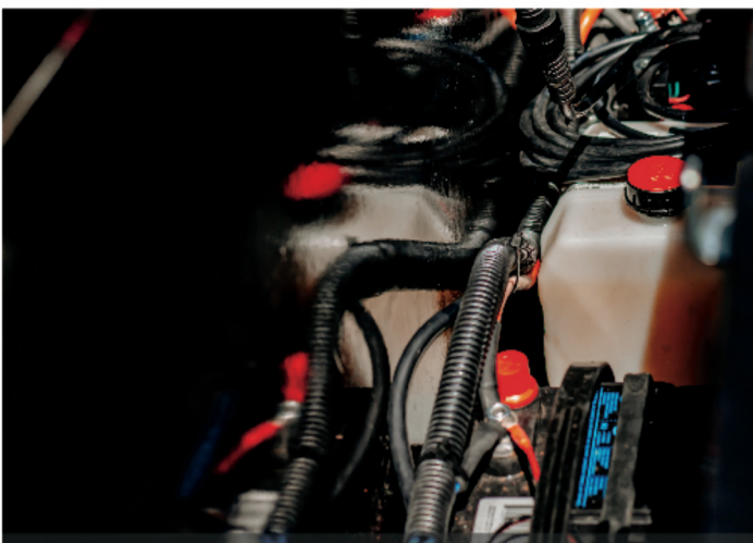
Lockable tool & equipment box. Charger, pump, battery & remote control.