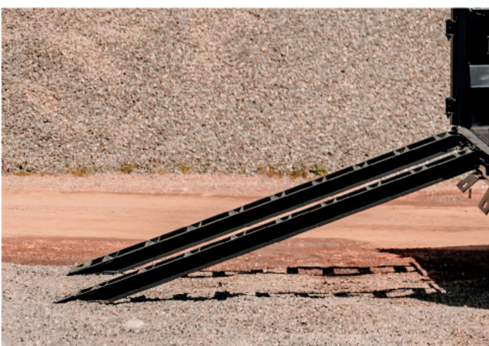
HD ramps quick access 6'5" long.