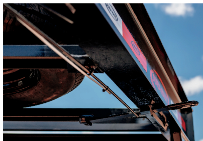
EZ latch for quick release.