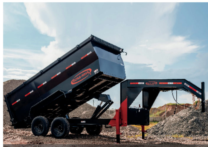
Heavy duty hydraulic scissor 45° lift angle.