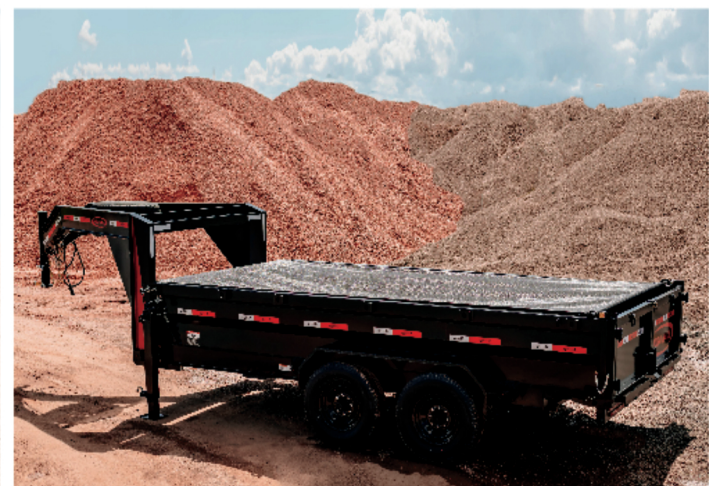
Extra long 20 ft tarp.