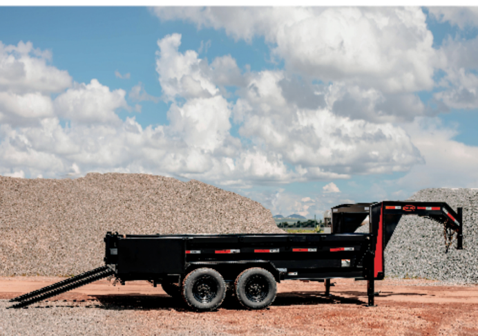
HD ramps quick access 6'5" long.