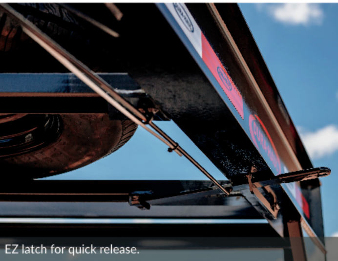
EZ latch for quick release.