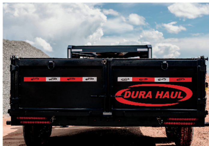
Twix door locking system.