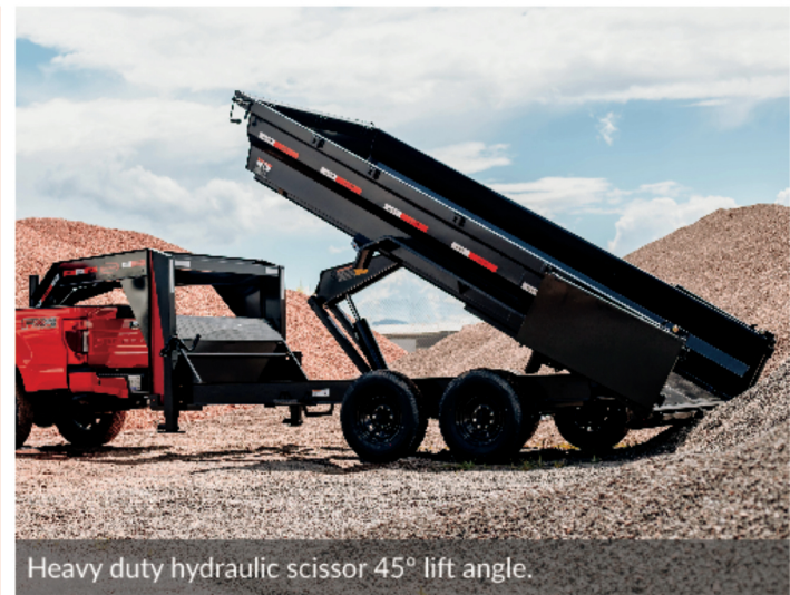
Heavy duty hydraulic scissor 45° lift angle.