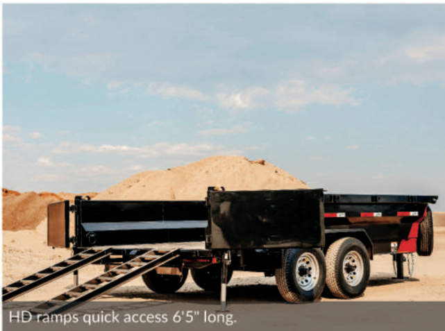
HD ramps quick access 6'5" long.