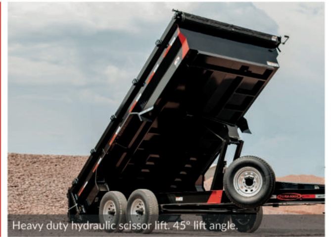
Heavy duty hydraulic scissor lift. 45° lift angle.