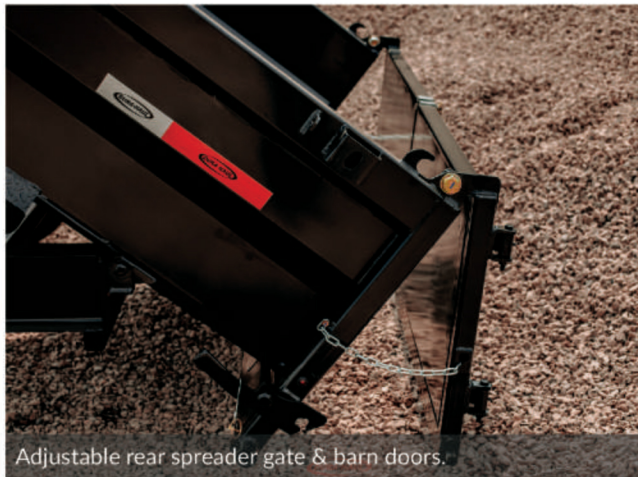
Adjustable rear spreader gate & barn doors.