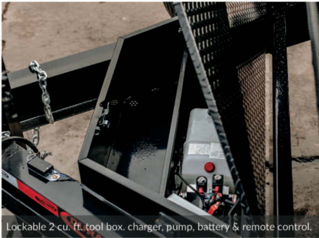
Lockable 2 cu. ft. tool box, charger, pump, battery & remote control.