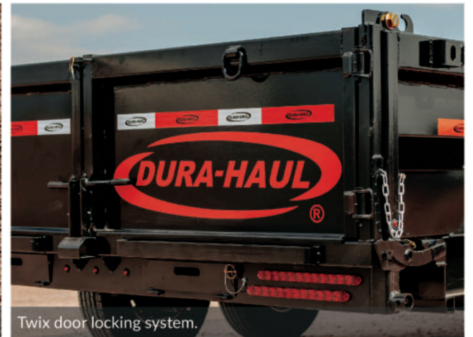
Twix door locking system.