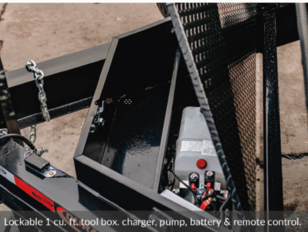
Lockable 1 cu. ft. tool box, charger, pump, battery & remote control.