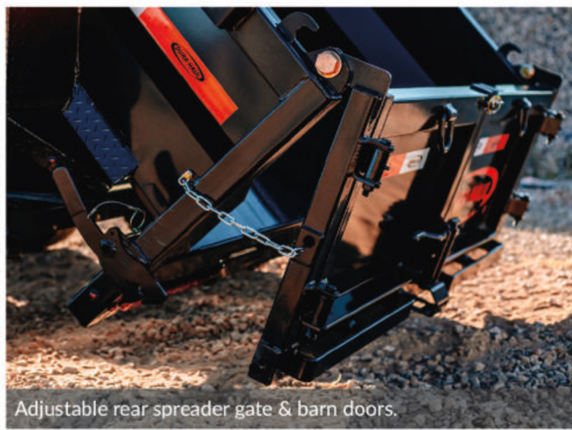
Adjustable rear spreader gate & barn doors.