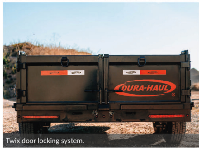
Twix door locking system.