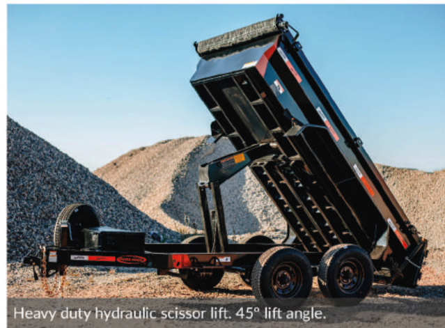
Heavy duty hydraulic scissor lift. 45° lift angle.