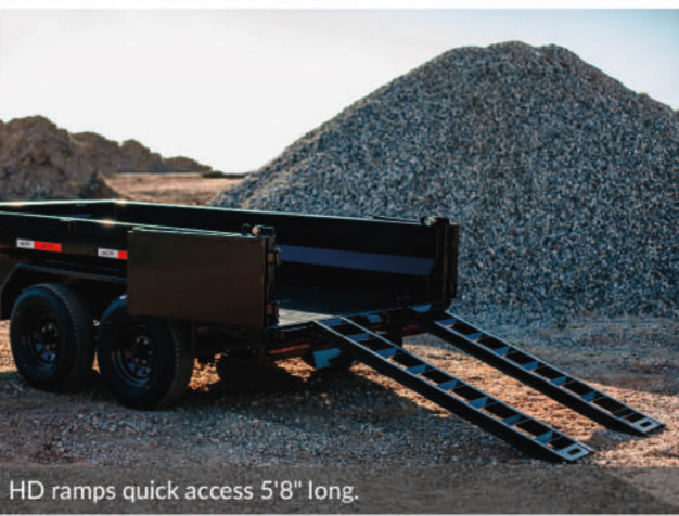
HD ramps quick access 5'8" long.