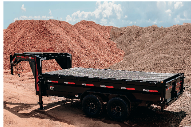
Extra long 20 ft tarp.