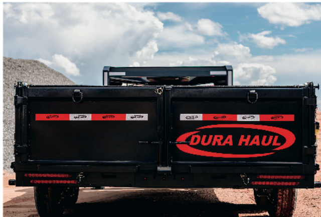
Twix door locking system.