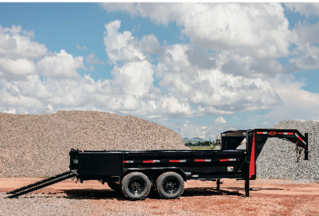
HD ramps quick access 6'5" long.