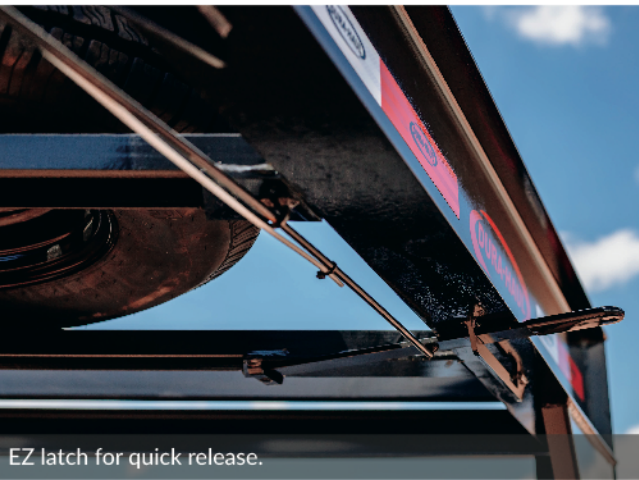
EZ latch for quick release.