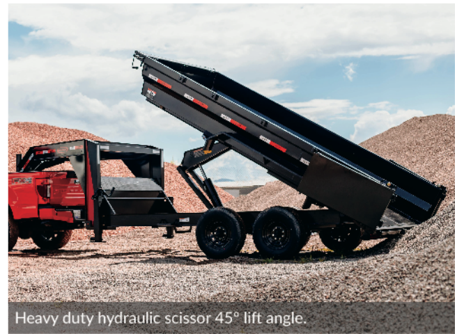
Heavy duty hydraulic scissor 45° lift angle.