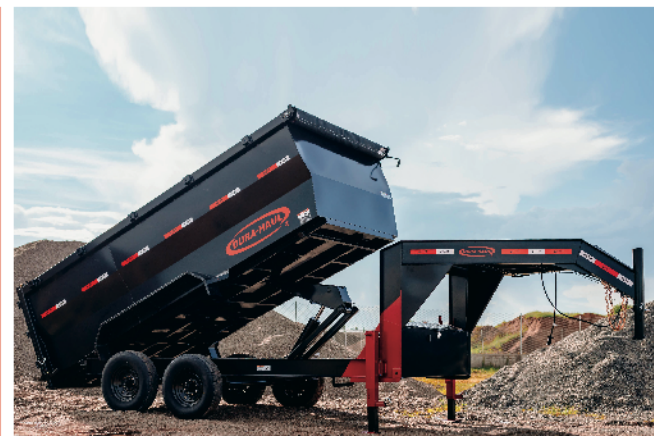
Heavy duty hydraulic scissor 45° lift angle.