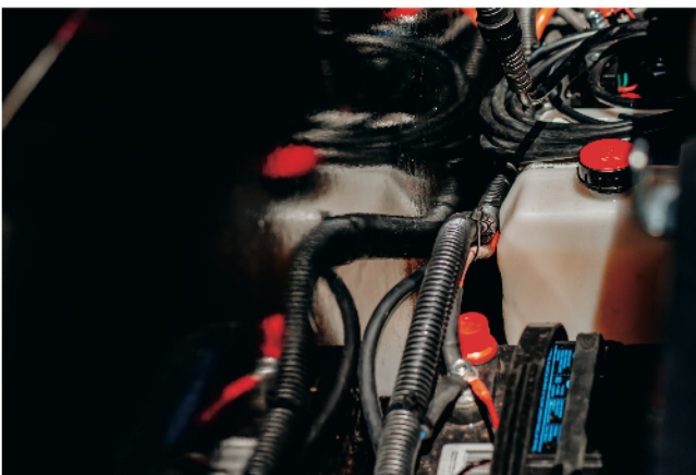
Lockable tool & equipment box. Charger, pump, battery & remote control.