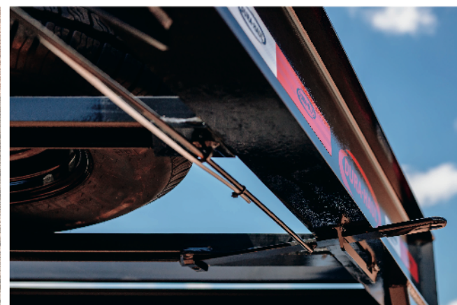
EZ latch for quick release.