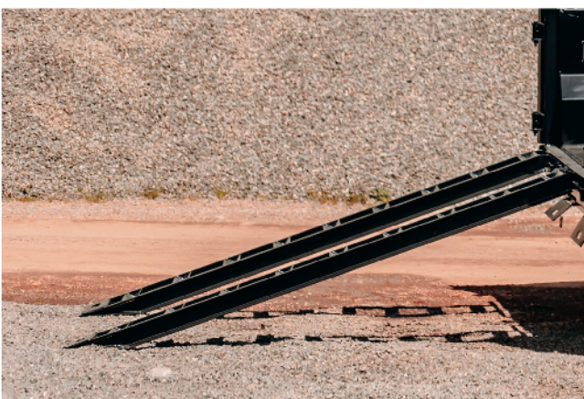
HD ramps quick access 6'5" long.