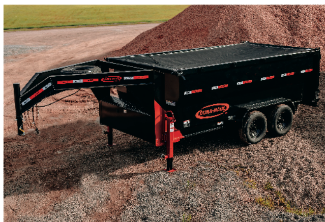
Extra long 20 ft tarp.